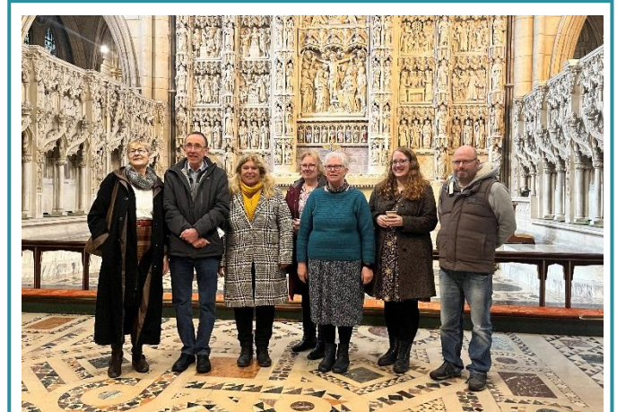
Newly Commissioned / Recommissioned Local Worship Leaders and Lay Pastoral Ministers from the parish of Liskeard at Truro Cathedral. From left to right:

On the 8 th March we held a prayer tent training session, where we also invited other churches from the Churches Together network to join us. As it happened, only the Salvation Army were able to join us, but it was still a really good time of sharing and encouraging one another.