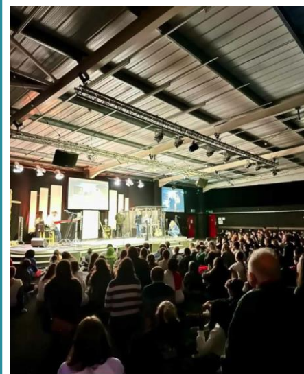
Sunday 11th February - Glow Youth Event