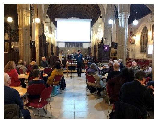
Maundy Thursday Shared Supper and Communion