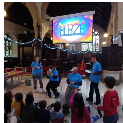
Easter Saturday - Blaze Easter Party